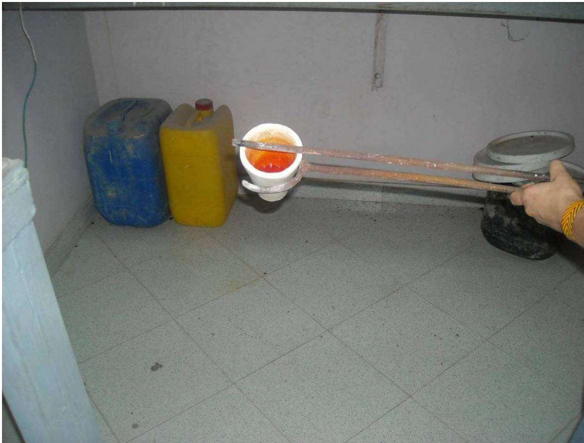
POURING MOLTEN GOLD & SILVER ORE AT EL GUAMO FOUNDRY INTO GRAPHITE CONTAINERS