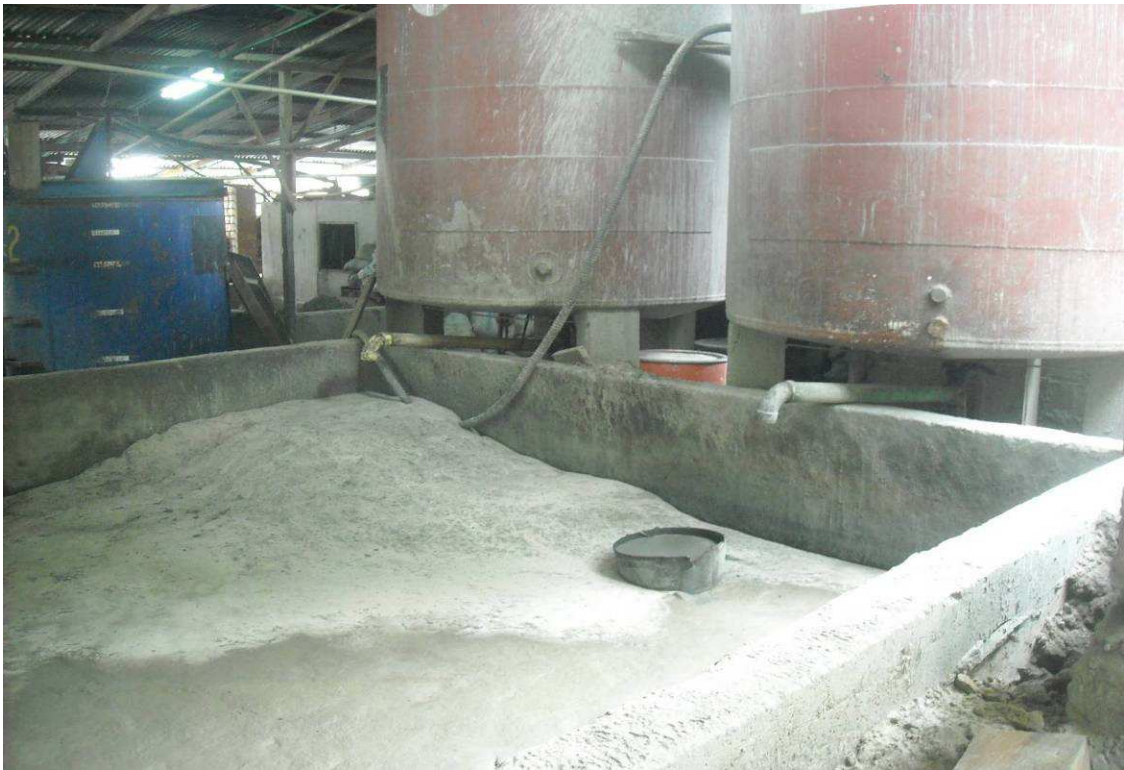
CRUSHED AND PROCESSED ORE READY FOR CYANIDATION PROCESSING