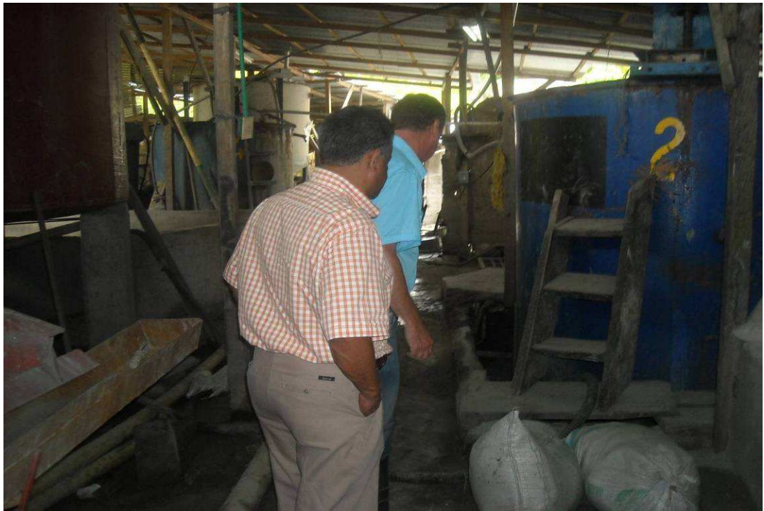
EL GUAMO MANAGER SHOWING MONA MINAS ENGINEER THE PROCESSING PLANT