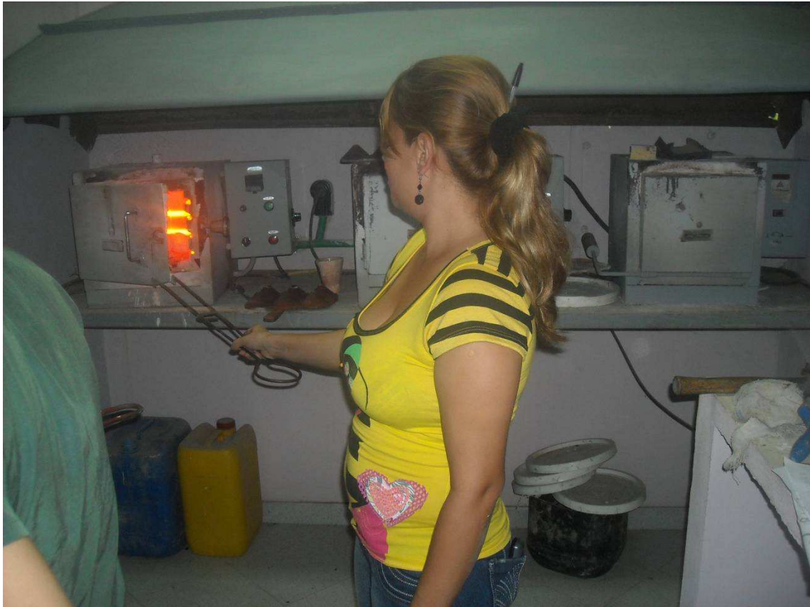
OPENING THE DOOR TO THE FURNANCE: THE ASSAY LABORATORY BELOW