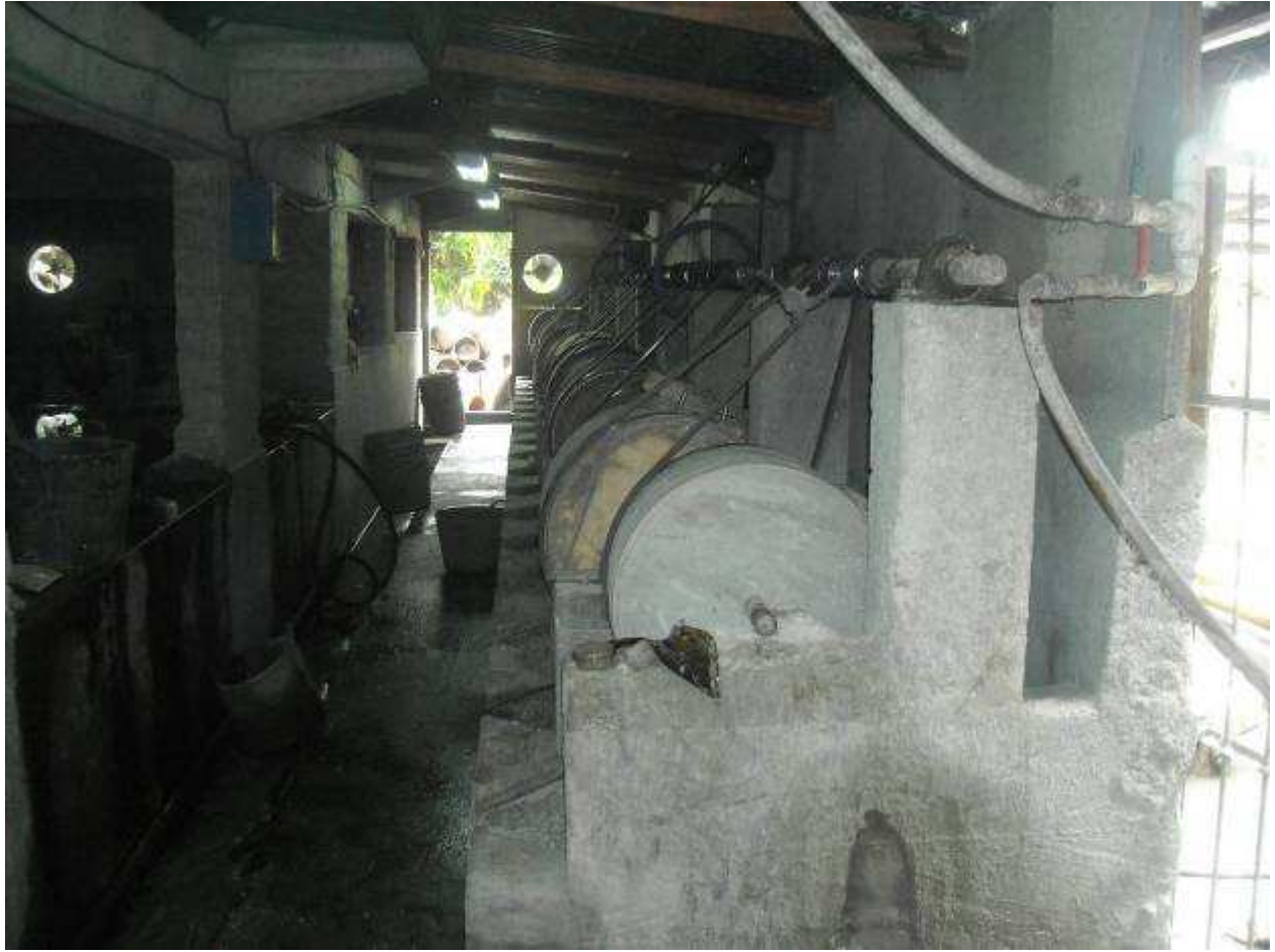
BALL MILLS USED TO MAKE THE GOLD & SILVER ORE A FINE POWDER FOR THE FINAL PROCESS