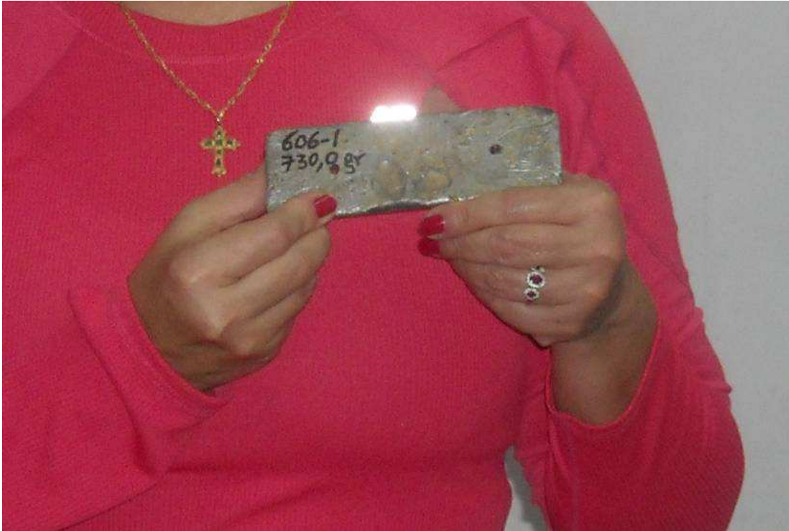
THE FINAL PRODUCT 730.9 GRAMS OF RAW GOLD AND SILVER BAR FROM 6 TONS OF ORE